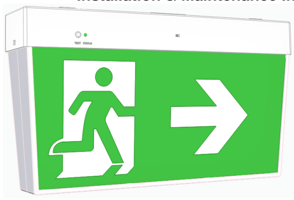
Designed in Australia to comply with the requirements of AS2293.3: 2018 and AS/NZS CISPR15: 2017